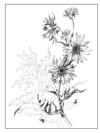
4. Compass Plant (Silphium laciniatum) Aster family (Asteraceae)