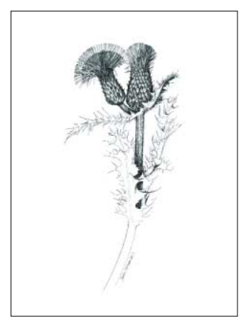
2. Prairie Thistle (Cirsium hillii) Aster family (Asteraceae)