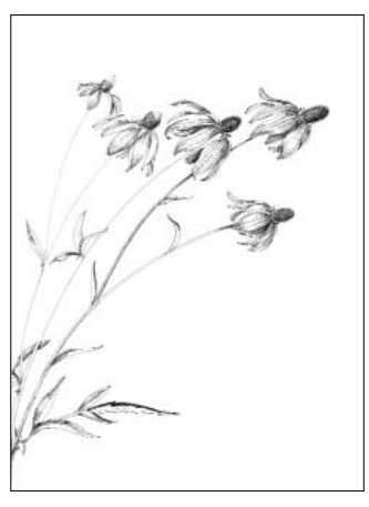
3. Grey-Headed Coneflower ( Ratibida pinnata ) Aster family (Asteraceae)