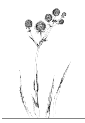
6. Rattlesnake Master (Eryngium yuccifolium) Parsley family (Apiaceae)