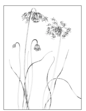
5. Nodding Wild Onion (Allium cernuum) Lily family (Liliaceae)