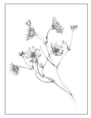
7. Prairie Dock (Silphium terebinthinaceum) Aster family (Asteraceae)