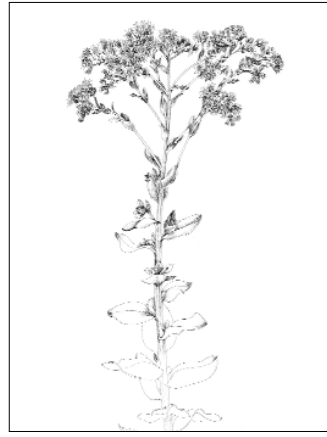
8. STIFF GOLDENROD (Solidago rigida) Aster family (Asteraceae)